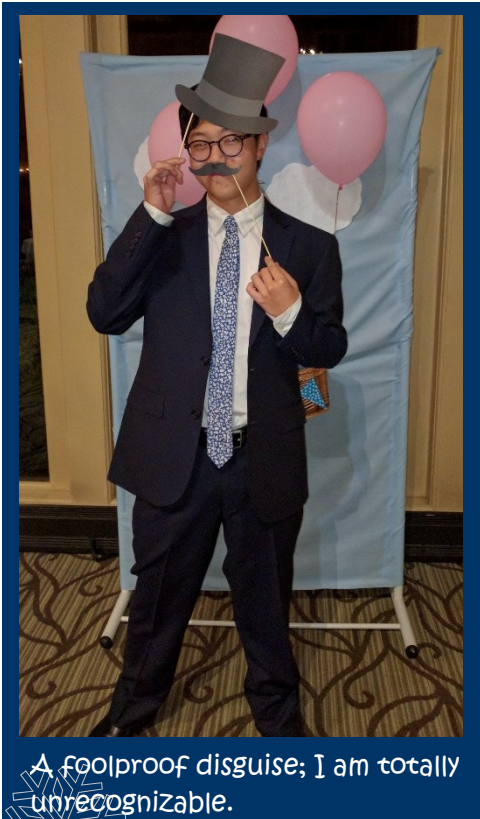
A foolproof disguise; I am totally unrecognizable.